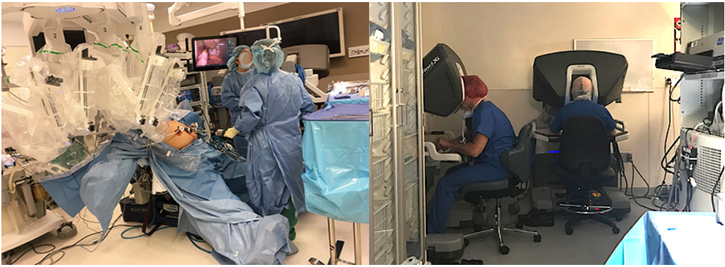
Fig. 1. Patient cart at the bedside, Fig. 2. Surgeon and Resident at console