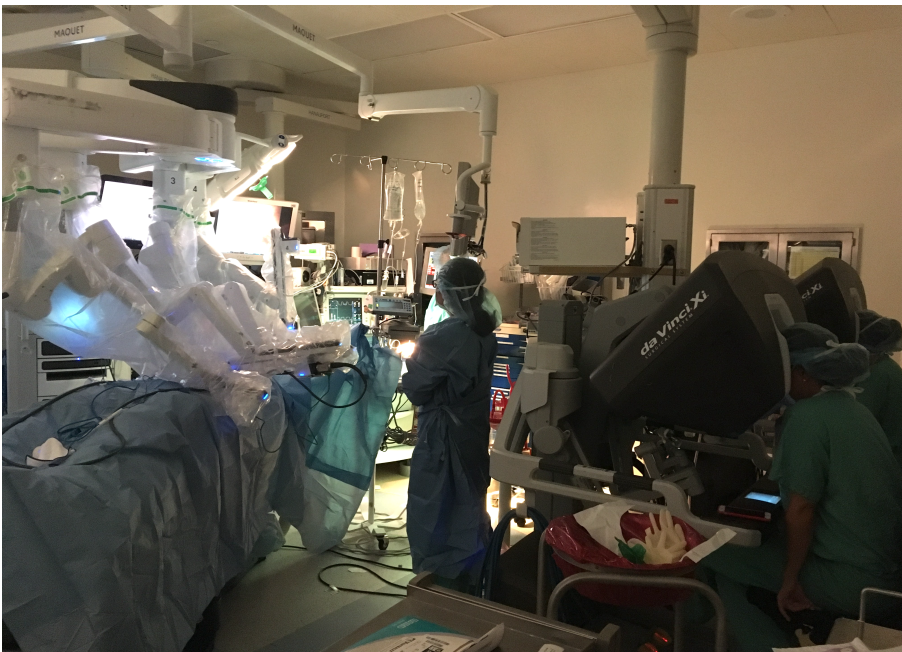
Fig. 5 Nurse views procedure on screen while resident observes through da Vinci console (right). Patient cart (left) is attached to patient.

The surgeon himself is sitting at a machine placed across the room with his head down, eyes focused into the machine's fixed stereoscopic viewer. His back is turned away from his team. In each hand, he grasps and manipulates, with his thumb and first two fingers, two extremely